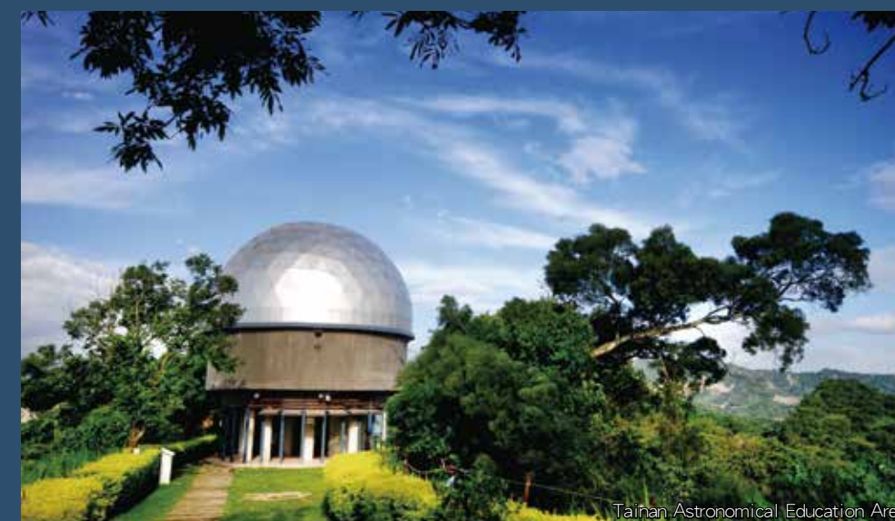
Tainan Astronomical Education Area

is located by Tsengwen River. The astronomic telescope, with main lenses of 76 cm in perimeter, is the largest one in Taiwan. It also has a 3D planetarium, the first of its kind to have a digital dome.