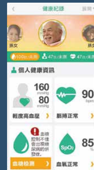
Smart Health APP

Tainan will establish a cloud platform for health and enable citizens to upload their own health evaluation to the cloud. By connecting it with health cards, everyone will be aware of their own health condition. Furthermore, technology will be used in diminishing epidemics. A unity lab of anti-epidemics within city network will be founded to improve disease prevention in a smart city.