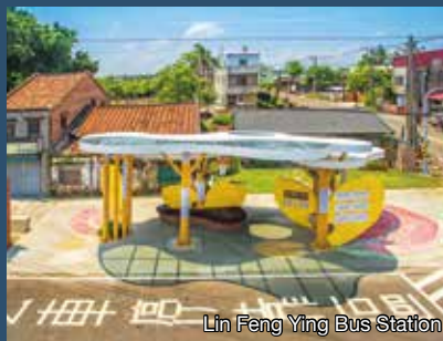
Lin Feng Ying Bus Station

Establishing a public transportation system and lessening the emissions of private vehicles are important for creating a low-carbon city. Since 2013, Tainan has been promoting Bus Rapid Transit Systematization. There are currently 9 mainlines, 74 branches, 19 urban bus routes, and two shuttles for high speed railway. In addition, there are six flexible bus routes and three tourist bus routes