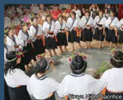
Siraya Night Sacrifice

These are the five important pilgrimages along the coastal areas of Tainan, held once every three or four years.