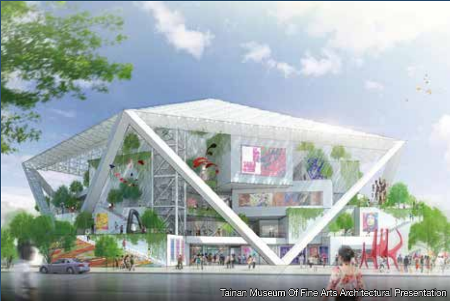
Tainan Museum Of Fine Arts Architectural Presentation

Tainan, a good place to dream, to work hard, to fall in love, to get married, and to live happily ever after.