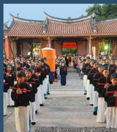
Memorial Ceremony for Confucius

Beehive Firecrackers consist of various types of firecrackers shaped like multiple rocket launchers. When the firecrackers are launched, they create a buzzing noise, hence the name Beehive Firecrackers. It was nominated as one of the top ten celebrations around the world.