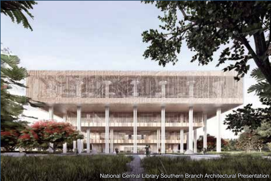
National Central Library Southern Branch Architectural Presentation

Under the four levels of administration mentioned above, the result of constructions in Tainan will be revealed soon. In terms of culture, requests to the authorities have been made in order to establish a southern branch of the National Library. There are also plans to build the Main Library of Tainan City. Five cultural parks are on schedule to be built, along with the Tainan City Art Museum. The completion of these sites will solidify the cultural aspects of Tainan.