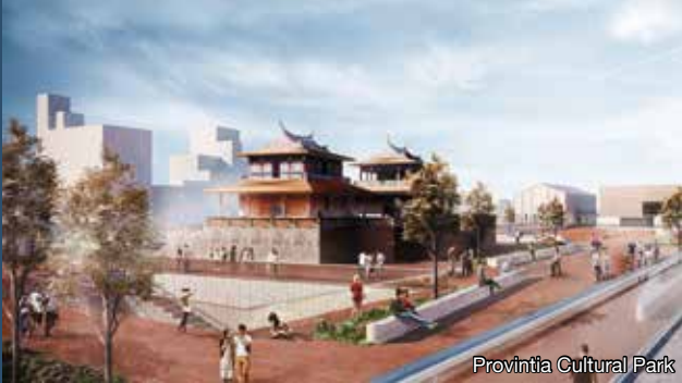
Provincia Cultural Park