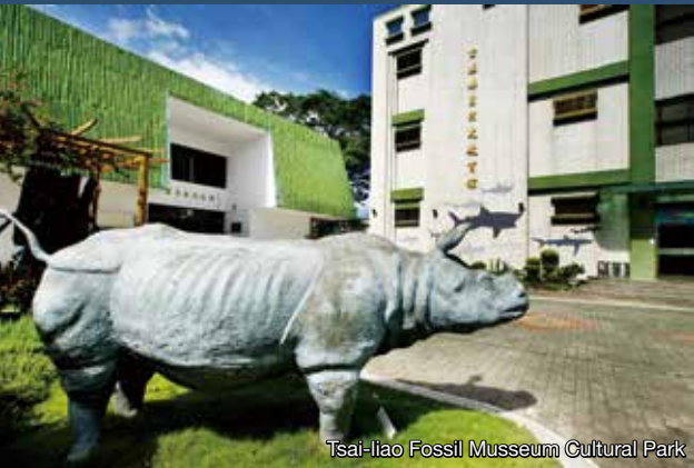
Tsai-liao Fossil Musseum Cultural Park