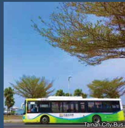
Tainan City Bus

Due to global warming, Tainan has been working on energy saving and lowering carbon emissions. Tainan has ample access to daylight, and has completed establishment of a photovoltaic industry. It has been praised as the low-carbon southern city. As of January 2017, 3575 cases of photovoltaic projects have been approved, the highest number in Taiwan.