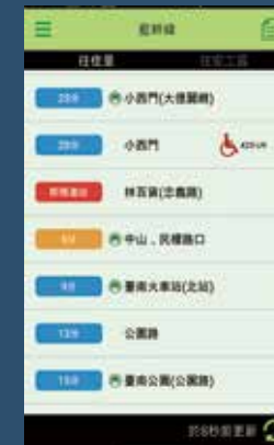
Smart Bus Movement APP

In order to improve traffic, Tainan plans to establish a smart control center for traffic and set down smart stop signs to make traffic smoother and swifter.