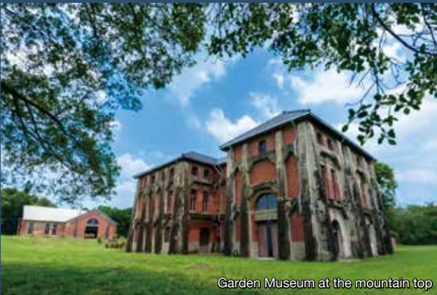
Garden Museum at the mountain top