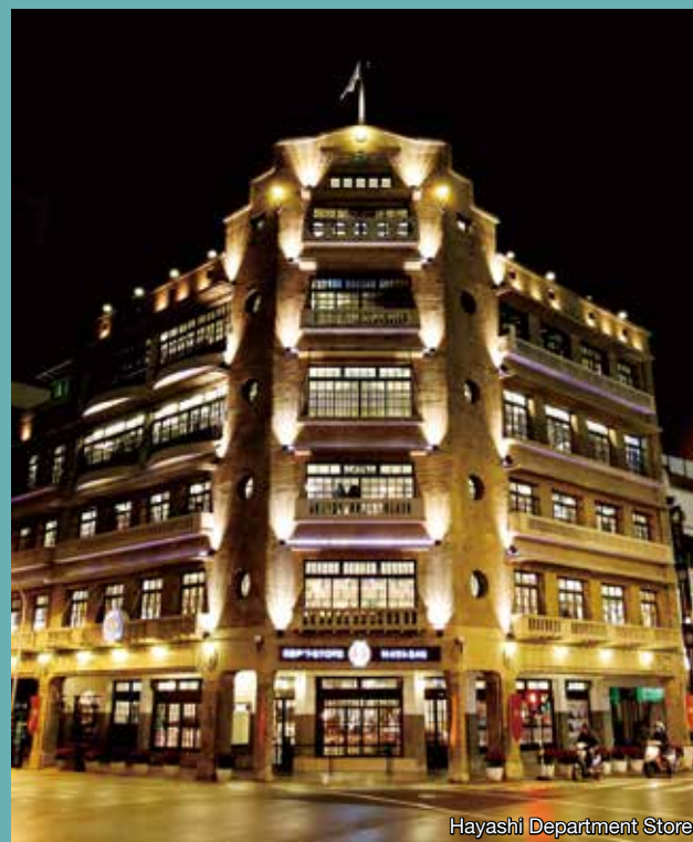
Hayashi Department Store