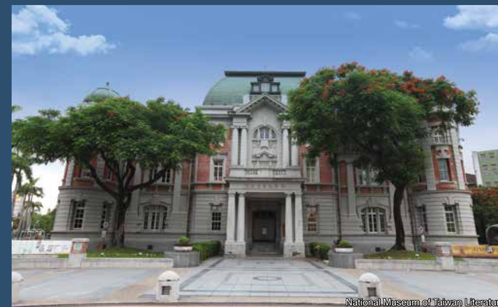
National Museum of Taiwan Literature

is the first national museum of literature in Taiwan. It collects, preserves, and studies contemporary literary history of Taiwan. The museum itself is a national monument that was built over a hundred years. It was the former Tainan State Government during Japanese Colonial Era and was founded in 1916.