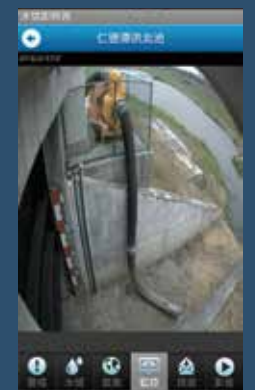
Tainan Flood Prompt Warning APP

Tainan will establish a cloud platform for health and enable citizens to upload their own health evaluation to the cloud. By connecting it with health cards, everyone will be aware of their own health condition. Furthermore, technology will be used in diminishing epidemics. A unity lab of anti-epidemics within city network will be founded to improve disease prevention in a smart city.